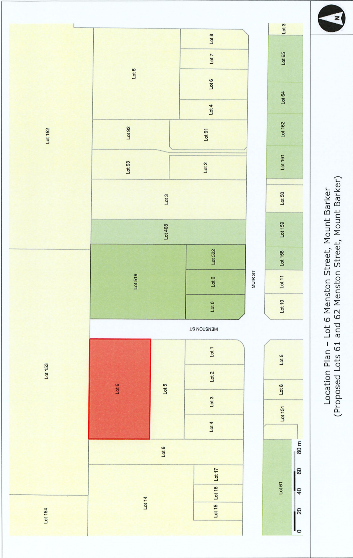
Location Plan – Lot 6 Menston Street, Mount Barker (Proposed Lots 61 and 62 Menston Street, Mount Barker)