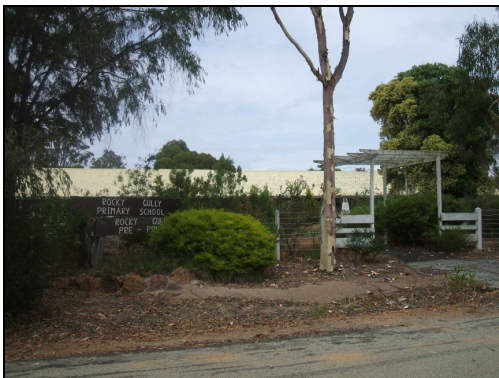
Rocky Gully Former Primary School