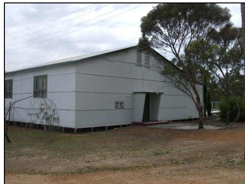
Rocky Gully Hall