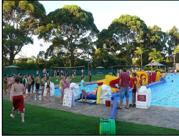
The ever popular pool inflatable draws a crowd!

A highlight of the season was the pool achieving accreditation as a WaterWise Aquatic Facility. This was achieved after undertaking a thorough analysis of water consumption and the completion of a water management plan, with key performance indicators identified and a water reduction target set.