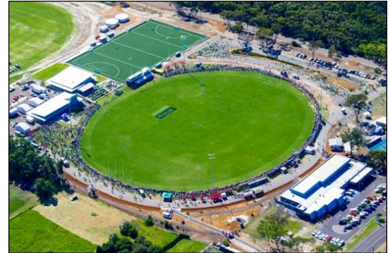
A sellout crowd at Sounness Park for the NAB Challenge game

This was the first ever AFL game in Mount Barker, and the first AFL game in the Great Southern for the past eight years. The game attracted a lot of attention, with fans travelling from near and far to catch a glimpse of some of their favourite footy players. Shire staff put in a huge effort to ensure the oval and surrounds were in top condition.