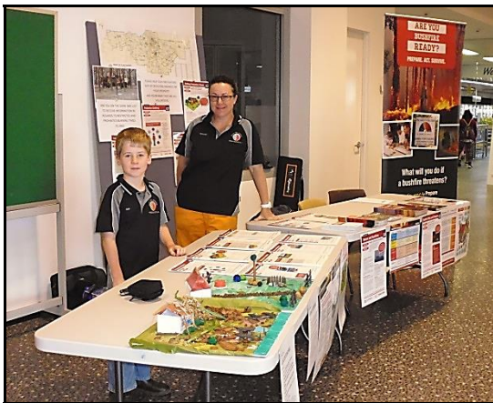
Promoting Bushfire Awareness Month at IGA

Flyers were circulated in the Plantagenet News educating the general public on fire prevention.