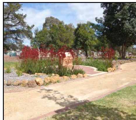
Mount Barker War Memorial paths and gardens

The beginning of the Australian Rules Football season saw Parks and Gardens staff undertake the preparation of Souness Park Oval for the NAB Cup challenge between the Fremantle Dockers and the Adelaide Crows. Held on 28 February 2016, the oval was deemed to be of a very high standard by the Perth Stadium Management Group. Other projects included work to bring the cricket oval to completion and the installation of a children's playground at Souness Park.