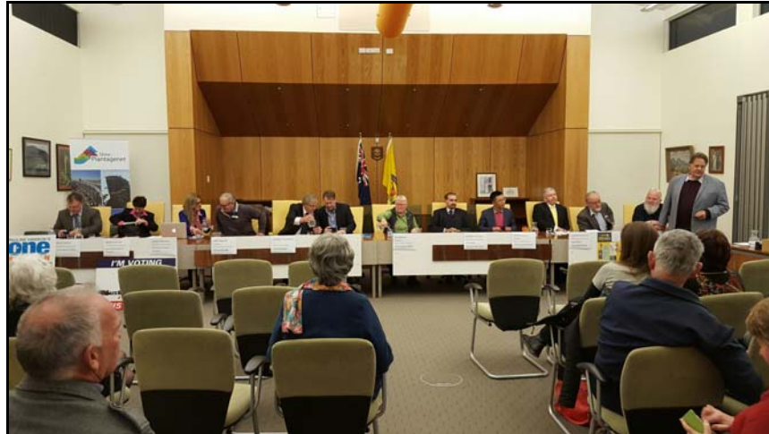
Meet Your Candidates Evening