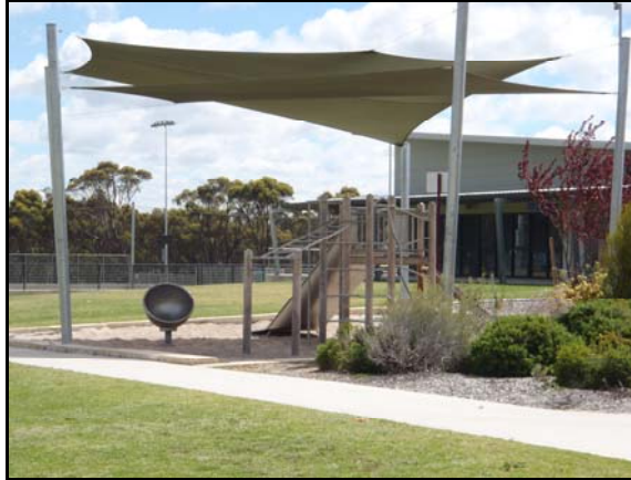
Children's playground at Souness Park

In June 2016, negotiations commenced for the Shire to take over the turf management at Frost Park to ensure race meetings can proceed as planned.