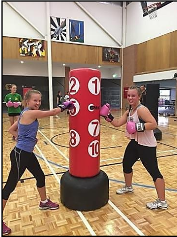
Local youth enjoying a fun workout

The Rec.Centre became involved in National Youth Week, with funding provided by the Department of Local Government and Communities. The Rec.Centre hosted a Youth Fitness Expo, in an effort to get kids exercising and eating healthily.