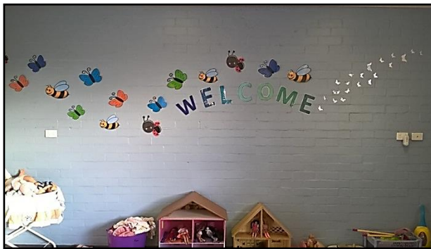
(L) Crèche facelift

The crèche had a facelift with a coat of paint and new wall art. The gymnasium received a Cable Cross Over machine and a clean out, creating a new user friendly lay out. The main hall was fitted with a new roof, including skylights, and the courts were resurfaced.