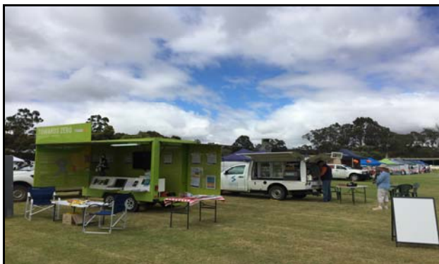
Mount Barker Community Fair stall