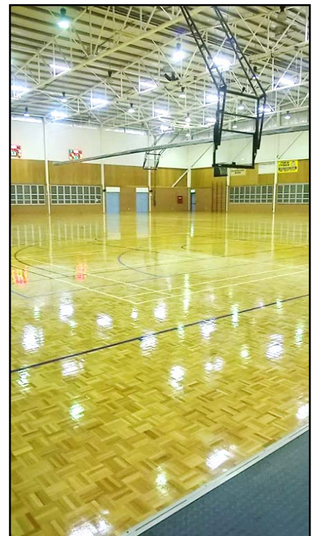
(R) New roof and polished floor in the Rec.Centre