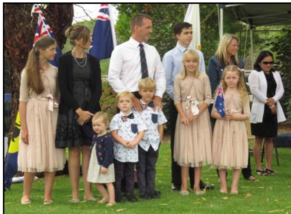
Australia Day Citizenship Ceremony

Three ceremonies were conducted during the year, which conferred Australian citizenship on 12 people. The largest ceremony was held on Australia Day, 26 January 2016.