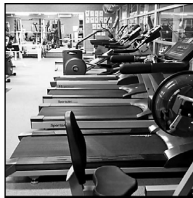
User friendly gym layout