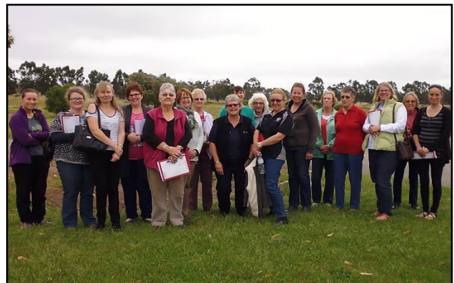
The Fire Awareness Workshop for Women was a big success